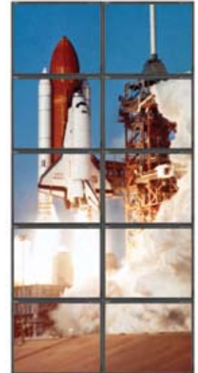
NEC's TileMatrix and TileComp technologies allow you to build video walls in various configurations (shown above), creating a custom-sized, virtually seamless screen for advertising, branding or high-tech decor.