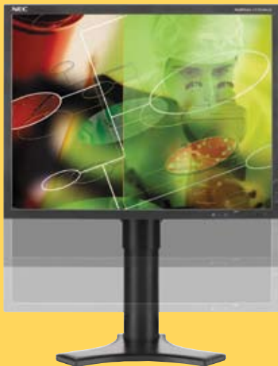
Height-adjustable stand (150mm range)

In addition to adding eye-pleasing aesthetics to your desktop, the design of the MultiSync 90 Series boasts many functional features that increase your viewing comfort and lead to gains in overall productivity.