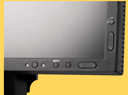
Redesigned OSM control buttons